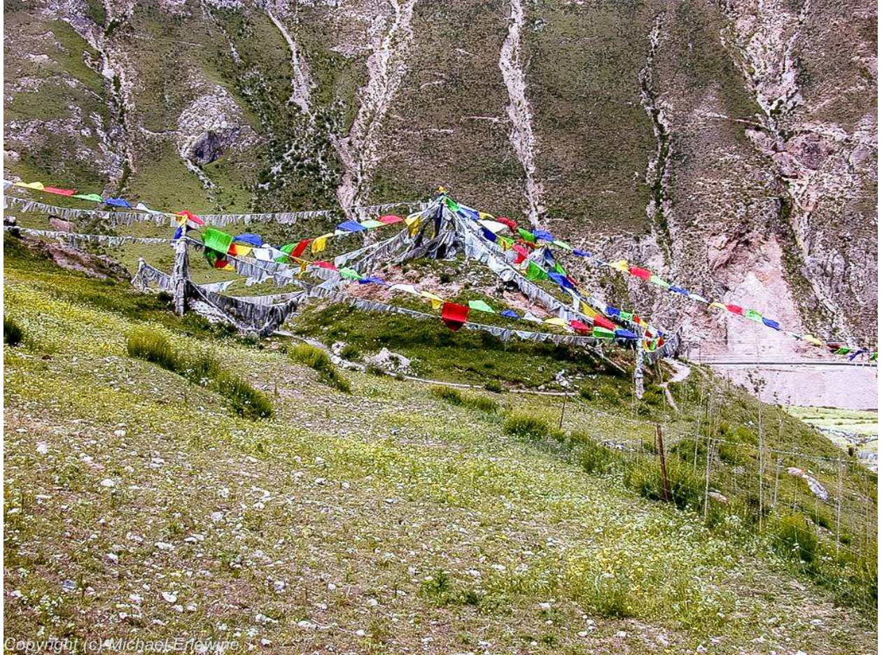
A close up of the Red Stupa.