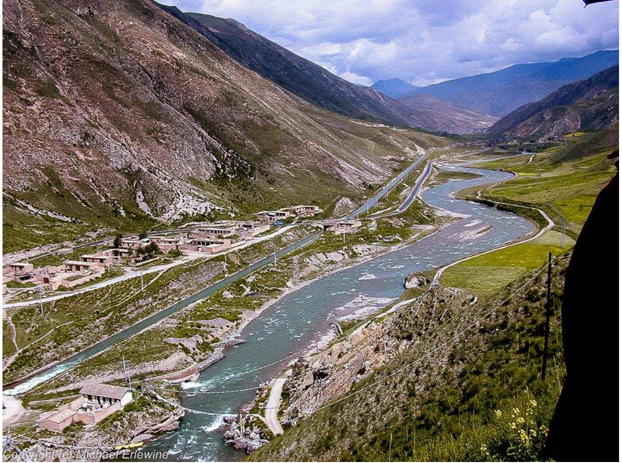
Here you can see the power spot in the lower part of this photo, where the prayer flags are.